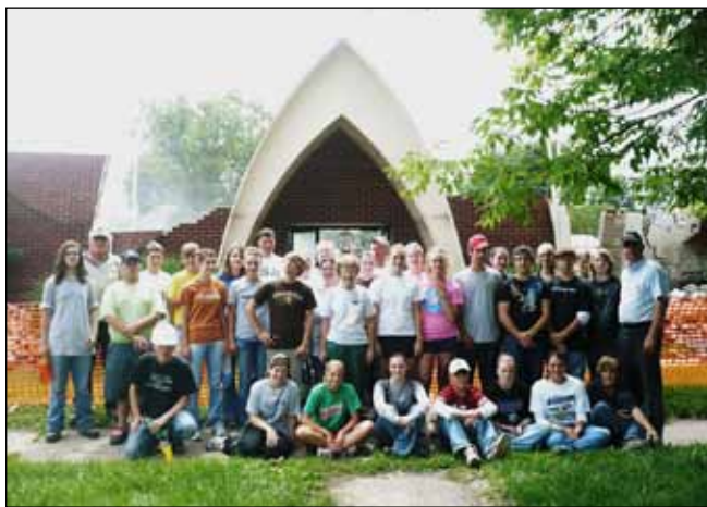
South Dakota District Youth Gathering participants and sponsors gather for a photo in front of a church being torn down in Cedar Rapids, Iowa.

Next year’s gathering will be the National Youth Gathering July 17-21, 2010, in New Orleans, La.