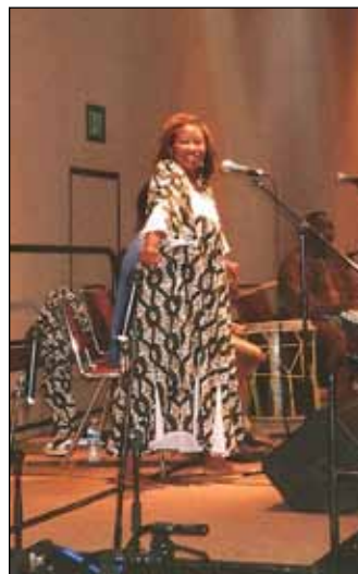
African drummers and dancers perform at the convention.

North Carolina barbecue meal, the men learned that 2,000 congregations of the LCMS and Lutheran Church—Canada, along with congregations from a number of other church bodies, had registered as Men's NetWork users.