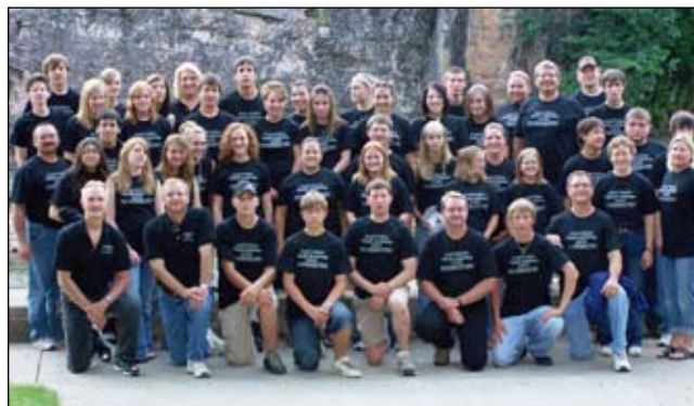
2008 Youth Gathering attendees in Spearfish.