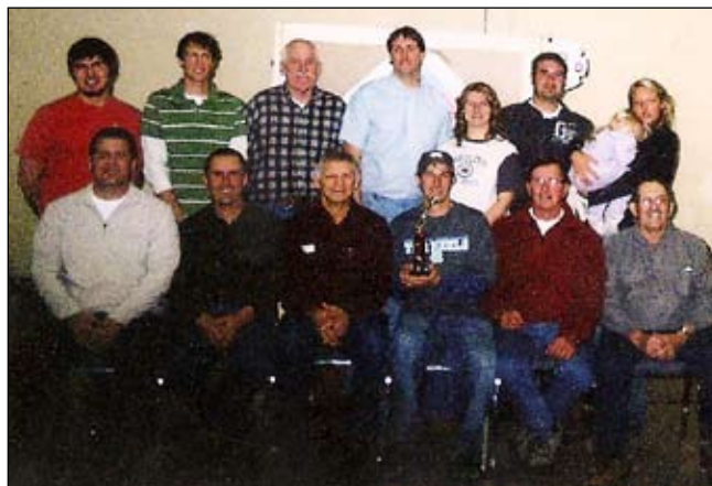
Emmanuel, Dimock, first place