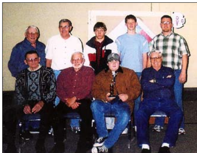
Trinity, Hartford, second place